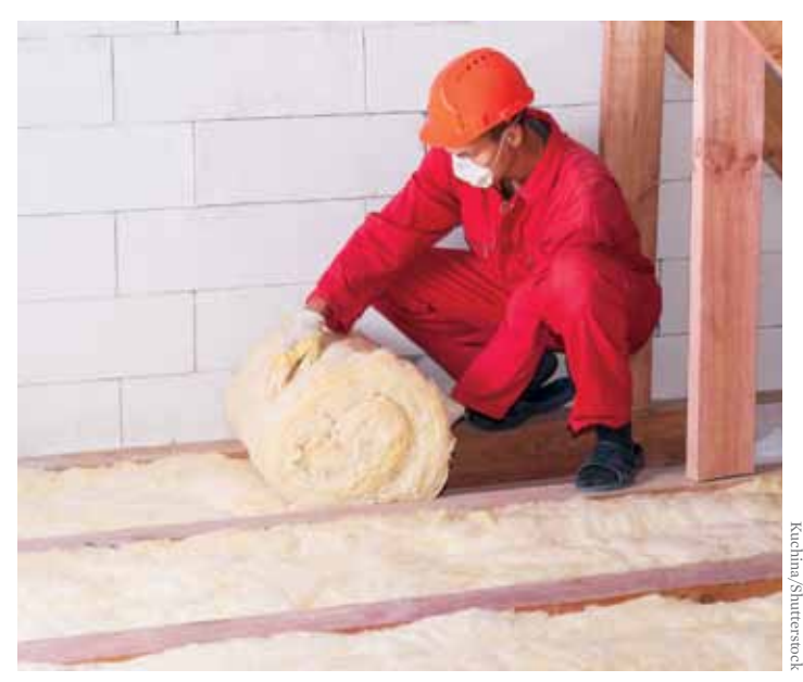
Energy efficiency is a powerful clean energy resource, and has played a key role in building momentum across states. Energy efficiency resource standards drive efficiency for homes and businesses.

a full partner in building clean energy momentum, through strong support for innovation and deployment. Efficiency standards, tax credits, research support, and other nationwide activities would provide a strong impetus for continued progress in all 50 states.