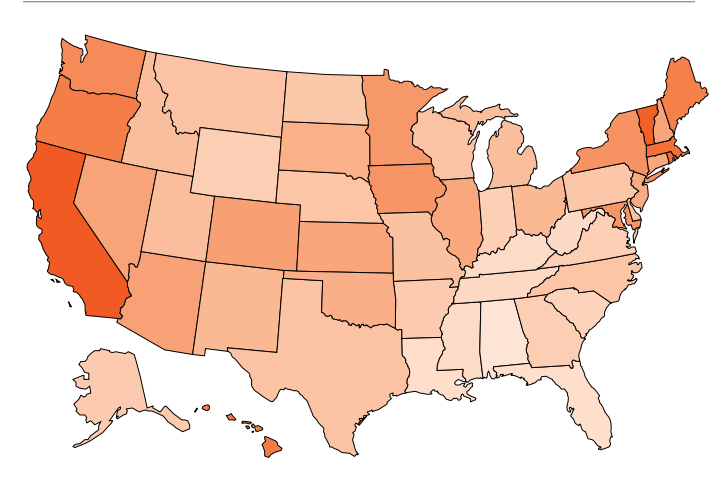
FIGURE ES-2. States Across the Nation Lead on Clean Energy Momentum

States from across the country drive clean energy momentum. Eight of the top 10 states in the UCS Clean Energy Momentum State Ranking are on the West Coast or in the Northeast, highlighting region-wide commitments to clean energy. Iowa leads in the Midwest, followed by Minnesota. Maryland, Colorado, Arizona, and Nevada also make the top 15.