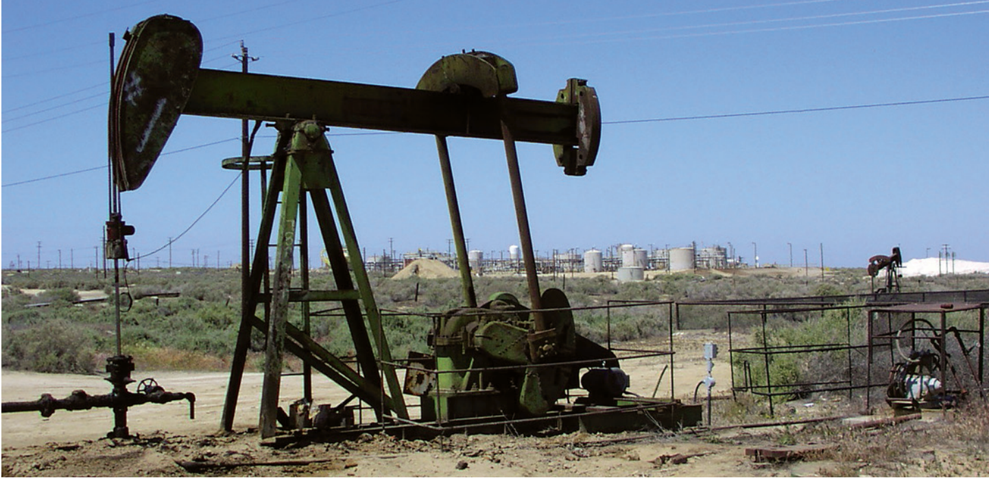
Antandrus/Creative Commons (Wikimedia Commons)