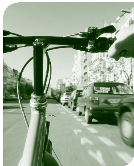
If everyone reduced their household's heat-trapping emissions by about four percent each year, we could avoid the dangerous consequences of global warming. Your transportation choices go a long way toward achieving this goal.

This goal is achievable; taken over time, the reduction is equivalent to approximately three to four percent a year. Nevertheless, meeting this goal will require strong leadership at the federal, regional, and state levels, and consumers must do their part as well. To help reduce your household emissions, we offer the following strategies.