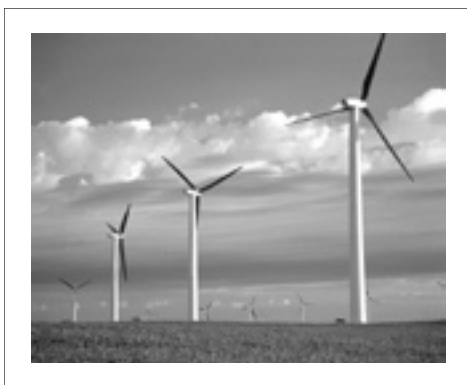
FIGURE 35 Minnesota Wind Farm

See page 51 for full-size color image of this figure