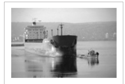
FIGURE 40 Managing the Lake and Stream Impacts of Climate Change

See page 52 for full-size color image of this figure