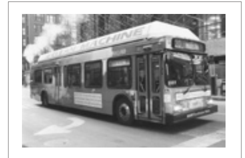
FIGURE 36 Illinois Fuel Cell Bus

See page 51 for full-size color image of this figure