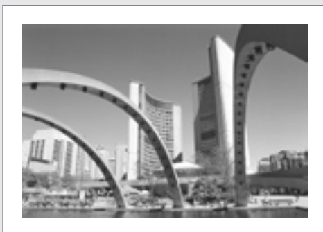
FIGURE 37A City Hall, Toronto

See page 51 for full-size color image of this figure