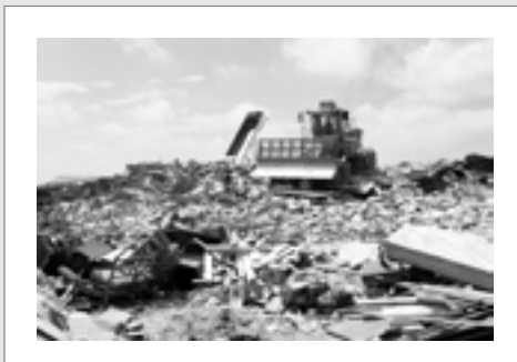
FIGURE 37B Toronto Shows Climate Solutions Leadership

See page 51 for full-size color image of this figure