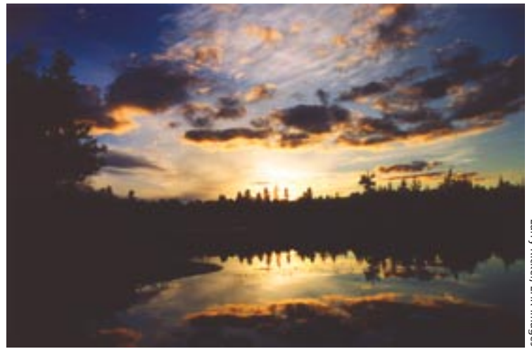
Larry Ricker, LHR Images

• Increasing atmospheric CO 2 and nitrogen will likely spur forest growth in the short term, but higher concentrations of ground-level ozone, more frequent droughts and forest fires, and a greater risk from insect pests could damage long-term forest health.