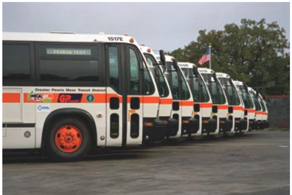
Warren Gretz, NREL

* The EPA's 1990 data provide the only complete greenhouse gas inventory for all sectors. Source: US EPA, 2003