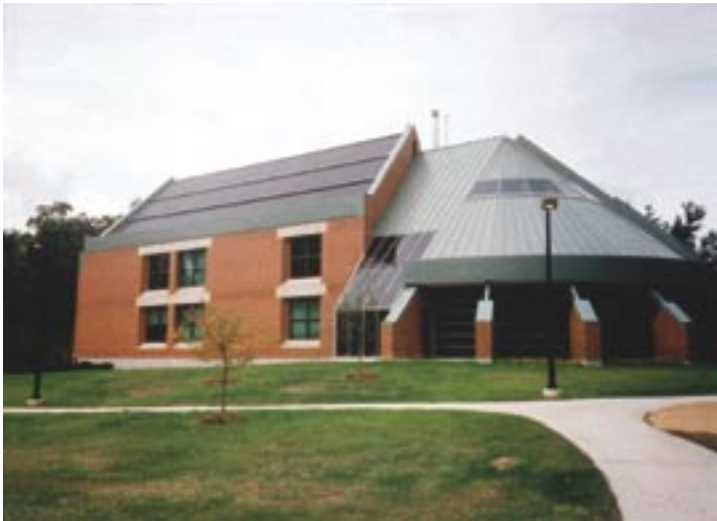
United Solar Systems Corporation, NREL

Innovative, affordable and prudent solutions are available to help reduce the severity of climate change.