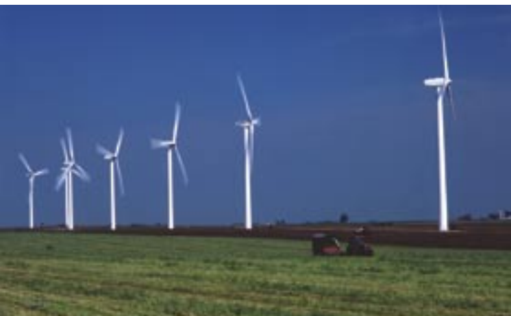
GE Wind Energy

• Climate change action plans. Illinois has a climate change action plan in place, but it will require strong support for implementation. Similarly, Chicago has committed itself to local emission reductions through the International Cities for Climate Protection Campaign.