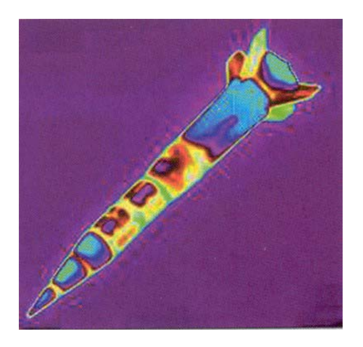
Figure 3: The image of the Aries target vehicle from the LEAP sensors just before intercept.

reported closing speed, we calculate that the interceptor and target collided at an angle of 107 degrees (i.e., 73 degree from head-on).