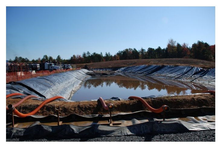
Wastewater from hydraulic fracturing operations can be highly saline and often toxic or radioactive. In many places, this water is stored at well sites in lined pits, such as this one in Arkansas.

Equally important is the issue of transparency. Public safety should take priority over trade secrets, which is the case for most industries regulated under the Toxic Release Inventory. But loopholes have allowed fracking operations to withhold the composition of their fracking fluids by claiming that information is proprietary. UCS maintains that the public has a right to know about chemicals being pumped into public lands, the oversight and monitoring of these activities, and their implications for public health and well-being. Thus, the chemical composition, volume, and concentration of all fracking fluids—even those considered proprietary—should be disclosed and made available online before drilling can begin.