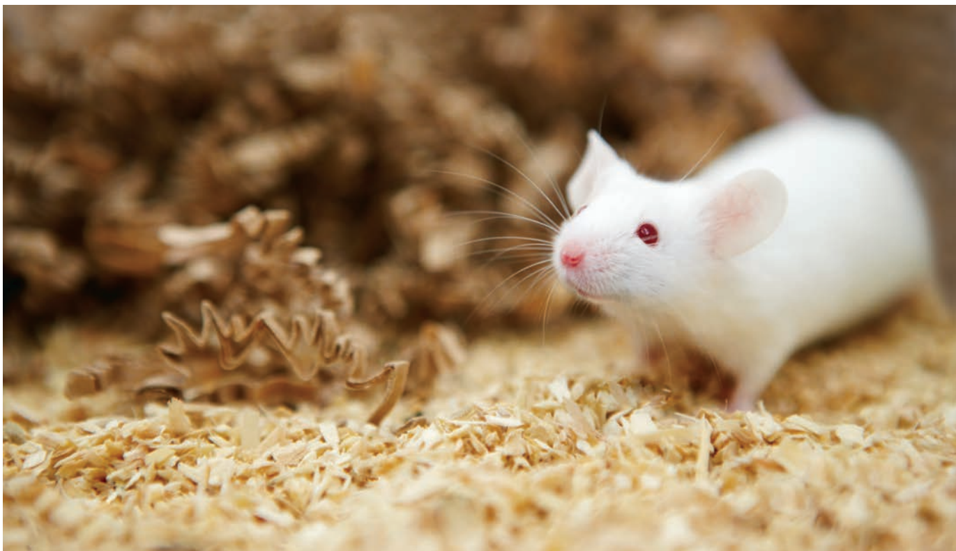
Animal rights activists have harassed scientists who study non-human subjects for decades. A recent uptick in the activists' use of open records requests has led to scientific societies and at least one university creating guidelines to protect researchers' privacy and suggestions for responding to such requests.