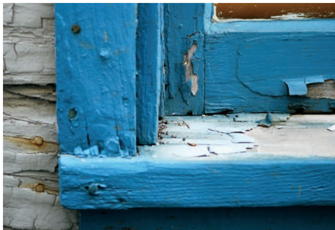
For decades, the lead industry attacked science and scientists to undermine public understanding of the harmful effects of lead on human health, significantly delaying regulation and control of the toxic element.

When BP asked to see their data and methodology, the scientists gave the company 50,000 pages of raw data and information on their research methods. That should have been all BP needed to verify the accuracy of the research. But the company convinced a judge to require the scientists to also turn over their private correspondence. Objecting to that release in the Boston Globe , the scientists noted that “our concern is not simply invasion of privacy, but the erosion of the scientific deliberative process.” They continued: