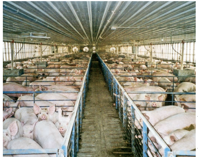
The North Carolina Pork Council filed an open records request the day a scientist released his study finding that people who lived near industrial hog farms had greater incidences of health problems such as headaches, diarrhea, and burning eyes. The council had also criticized the scientist’s earlier research, which found that hog farms are more common in low-income communities of color.