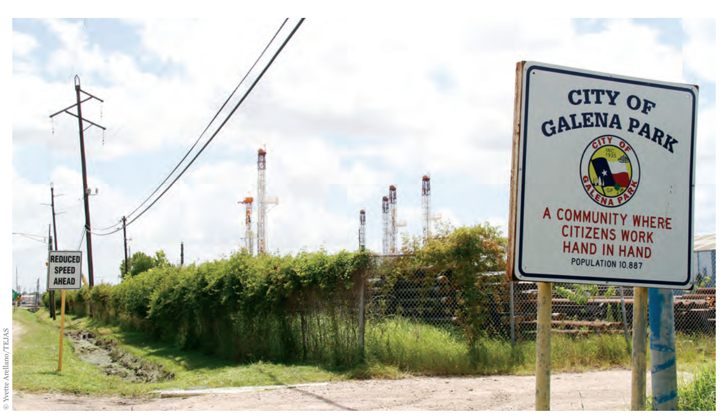
Communities like Galena Park in east Houston need stronger health and environmental policies at municipal, state, and federal levels to protect residents from toxic air pollution and potential chemical release from nearby chemical facilities.

The EPA should ensure that communities have access through effective and purposeful outreach to information on hazards and emergency planning under its RMP program and that they have information on facility hazards submitted to states under the Emergency Planning and Community Right-to-Know Act. Local residents, trained health care professionals, emergency responders, and health-care providers need this information to prepare for and effectively respond to a chemical disaster, should one occur. Communities should be