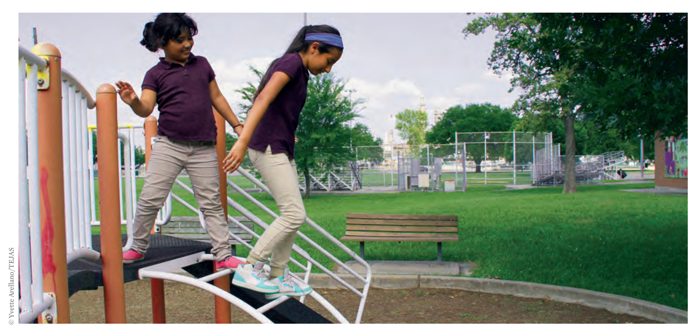
Major toxic air pollutants, including those found in high concentrations in Harrisburg/Manchester and Galena Park, are linked to cancers and other serious illnesses affecting the eyes, heart, and respiratory system.

are not identified or for which data on these health impacts are unavailable. Therefore, these risk and hazard estimates represent only a subset of the total potential cancer and non-cancer risks associated with air toxics exposures. It is also important to note that these risk estimates do not consider ingestion or the breathing of indoor sources of air toxics as an additional exposure pathway.