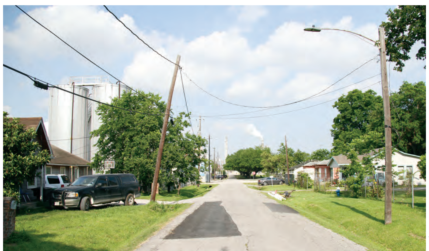
Due to a lack of comprehensive zoning laws in Houston, many fenceline communities lie directly next to chemical facilities, and hence are exposed to high levels of air pollution and risk of catastrophic accidents. Compared with the Houston urban area, neighborhoods such as Harrisburg/Manchester and Galena Park comprise a larger percentage of African Americans, Latinos, and people living at or near poverty levels.

The release of toxic chemicals from industrial sources into surrounding communities is all too common. The EPA's Risk Management Plan (RMP) program encompasses the nation's most high-risk industrial facilities that produce, use, or store significant quantities of toxic and flammable chemicals. Among other requirements, these facilities must prepare plans for responding to a worst-case incident such as a major fire or explosion in which toxic chemical pollution is released into the surrounding community. The EPA estimates that approximately 150 catastrophic accidents occur each year in regulated industrial facilities. The EPA notes that these accidents "pose a risk to neighboring communities and workers