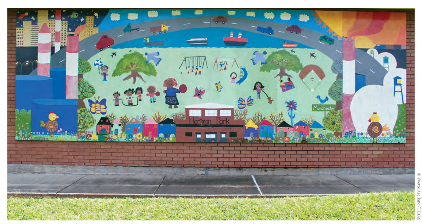
Significant improvements in monitoring and regulating chemical exposure are needed to ensure the health and safety of east Houston residents.