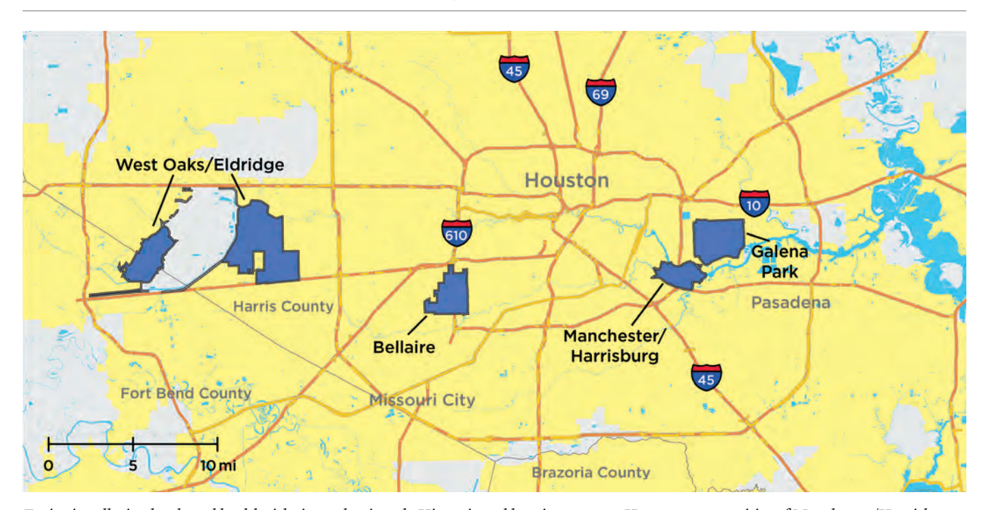
FIGURE 1. The Four Houston-area Communities Analyzed for Toxic Chemical Pollution and Health Risks

Toxic air pollution levels and health risks in predominately Hispanic and low-income east Houston communities of Manchester/Harrisburg and Galena Park were compared the wealthier and predominantly white west Houston communities of Bellaire and West Oaks/Eldridge.