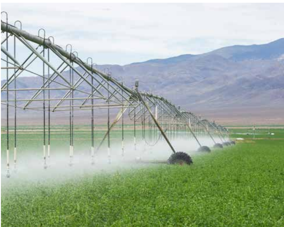
A significant amount of California's groundwater is used for irrigation. Groundwater sustainability agencies work with farms, residents, governments, and other water users to create comprehensive plans for managing and preserving this vital resource.

The Promotores studied the toolkit and delivered a presentation about it to other Cuyama Valley residents.