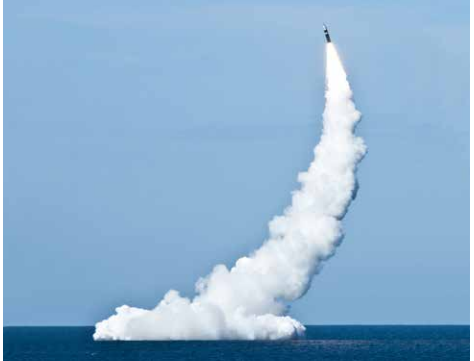
The administration already has some 2,000 ready-to-use nuclear weapons at its disposal. But apparently that’s not enough.

In its 2018 assessment of US nuclear forces—called the Nuclear Posture Review (NPR)—the administration argues that the new Trident warhead “will help counter any mistaken perception of an exploitable ‘gap’ in US regional deterrence capabilities.” The term “regional deterrence capabilities” is code for low-yield nuclear weapons