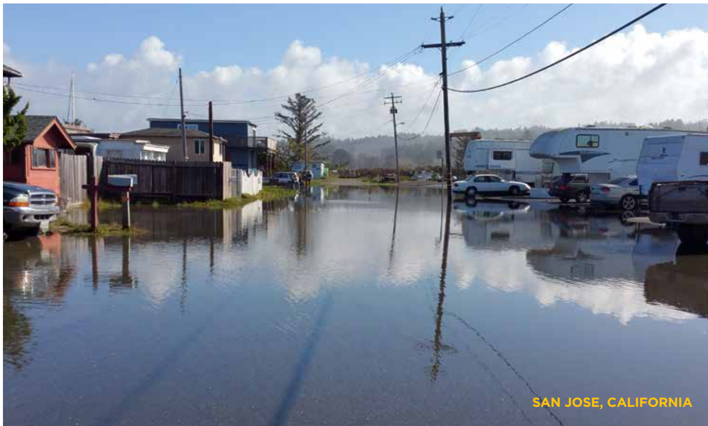
SAN JOSE, CALIFORNIA

restoring the federal flood risk management standard [repealed by President Trump],” she says. “Or updating federal flood risk maps to reflect sea level rise. Changing policies around disaster management to encourage more risk mitigation, and less business-as-usual rebuilding. And providing resources and information for homeowners in high-risk communities to understand their risk and figure out their options.”