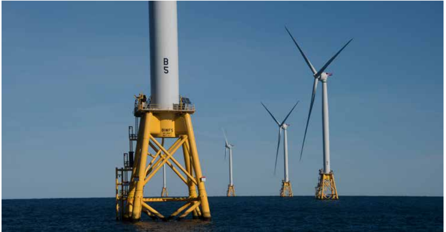
The first US offshore wind farm was installed off the coast of Rhode Island in 2016 and has been providing clean electricity to New England ever since.

With several significant new approvals, the US offshore wind power industry has passed an important threshold in recent months, with project-driving mandates from Northeast and mid-Atlantic states over the next decade totaling more than 8,000 megawatts. That's equivalent to the amount of electricity used by nearly 5 million homes (try out the math at http://blog.ucsusa.org/offshore-wind-calculator ). And with the help of UCS analytical work and advocacy, especially in Massachusetts, the United States is now poised to become a major player in offshore wind power, despite having lagged behind Europe for a quarter century.