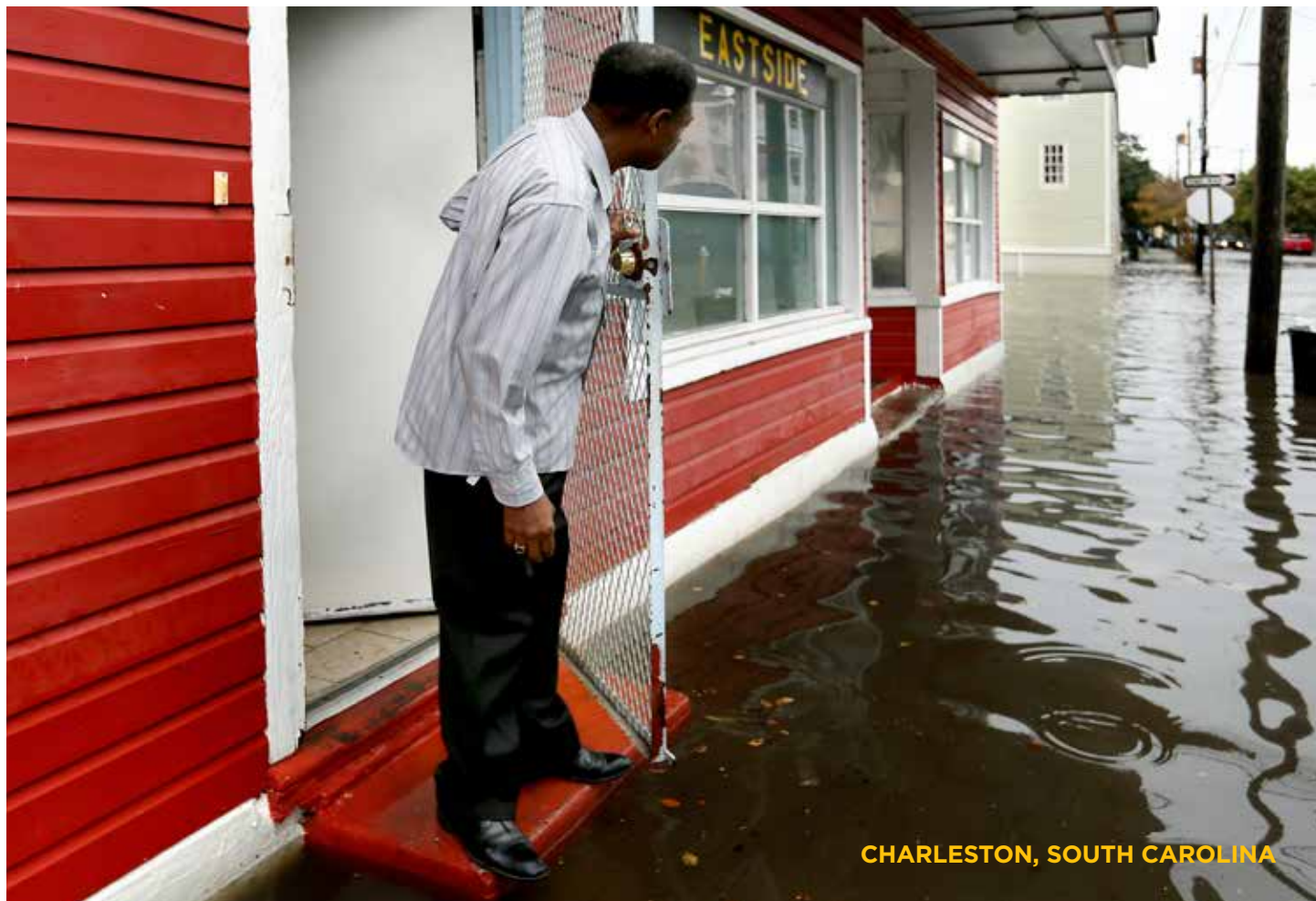
CHARLESTON, SOUTH CAROLINA

“Unlike housing market crashes of the past, where property values eventually rebounded, chronically inundated properties will only go further underwater as seas rise—literally and figuratively,” she says.