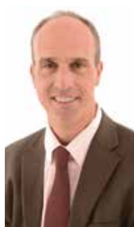
By Ken Kimmell

As I write this column, the Union of Concerned Scientists is gearing up for what is likely to be one of the biggest fights of the Trump era—the proposed rollback of vehicle fuel economy and emissions standards. These standards, which UCS led the charge to secure in 2012, have already improved the fuel efficiency of cars, trucks, and SUVs, and will cut carbon dioxide emissions by approximately 500 million tons by 2030, reduce oil consumption by 2.4 million barrels per day, and save consumers an average of $6,000 at the gas pump over the life of a vehicle.