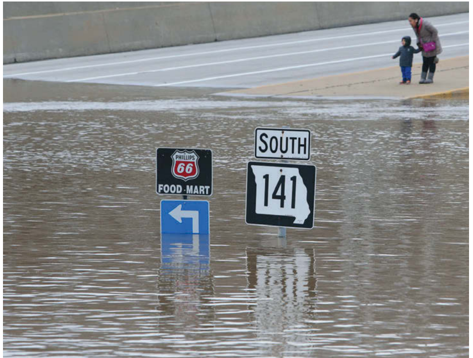
Inland flooding affects thousands of homes and businesses around the country every year. Here, a December 2015 storm inundated towns in and around St. Louis, Missouri.

Flooding is a natural process that occurs when rivers or land don't have enough capacity to absorb or drain large amounts of water from rain or melting snow. We've always experienced floods, but we haven't always seen rainstorms with the frequency and intensity we are