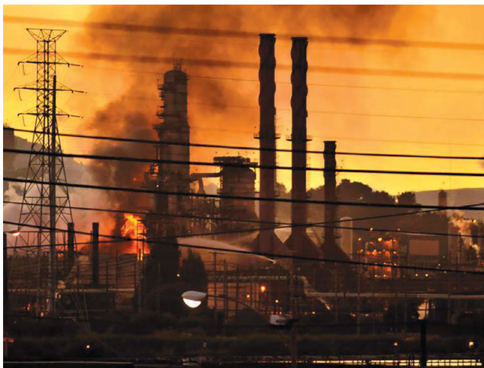
Toxic chemicals released during a 2012 fire at this Chevron refinery in California threatened thousands of nearby residents, nearly half of whom live in poverty.