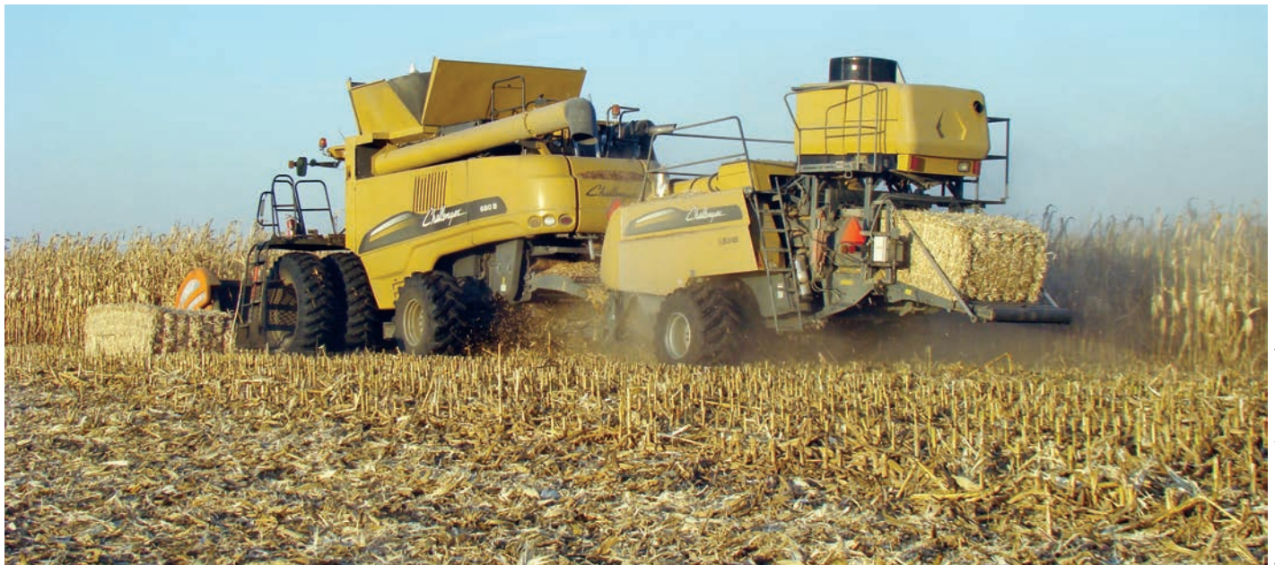
Agricultural residues are a natural by-product of primary crops such as corn and can be used to generate energy or fuel.

While removing residues for use in producing bioenergy absent any other changes in agricultural practices could worsen existing environmental challenges, farmers can adapt their practices to minimize the potential harm. For example,