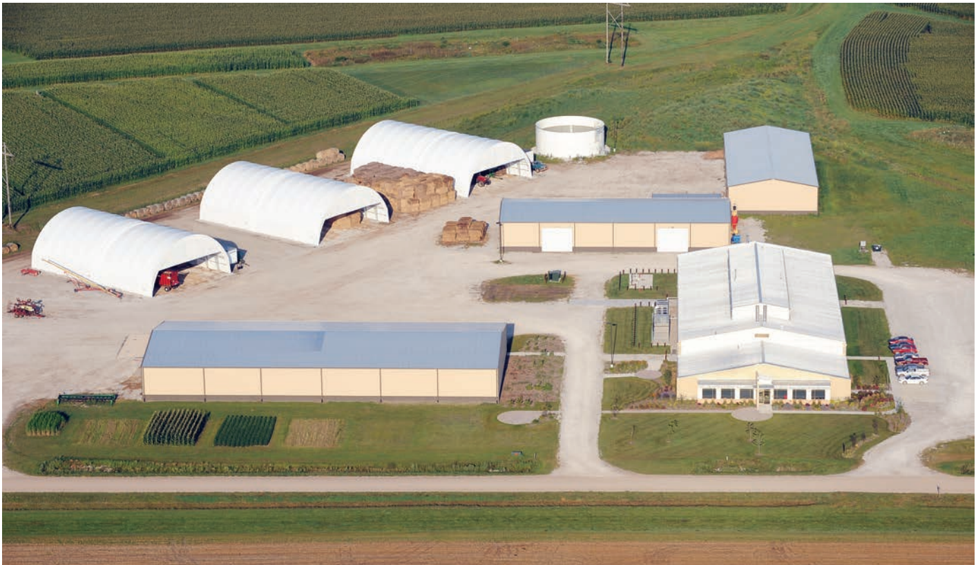
Researchers at Iowa State University's BioCentury Research Farm study new ways to process agricultural residues and other advanced bioenergy feedstocks.

While agricultural residues and manure are available at large scale from today's U.S. agricultural system, the nation could