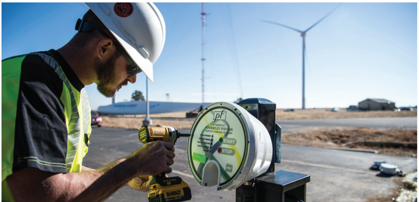
Electric vehicle users can often be flexible in the exact timing of vehicle charging, allowing for optimized charging programs, such as through this demonstration system being installed, which allows coordination of charging needs across users to lower costs and limit strain on grid infrastructure.