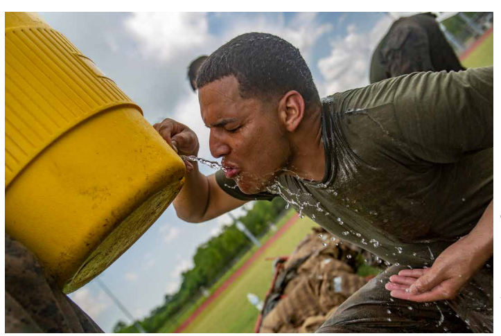
A marine drinks water following a combat conditioning exercise in Louisiana. Without action to curb heat-trapping emissions, military personnel will be subject to the increasing risk of heat-related illnesses such as heat exhaustion and heat stroke.

Permanently authorize program funding for the Fort Benning Heat Center to ensure consistency and productivity of the center's efforts. This first-of-its-kind center is doing critical research into prevention and care for HRI and developing best practices and protocols for the field.