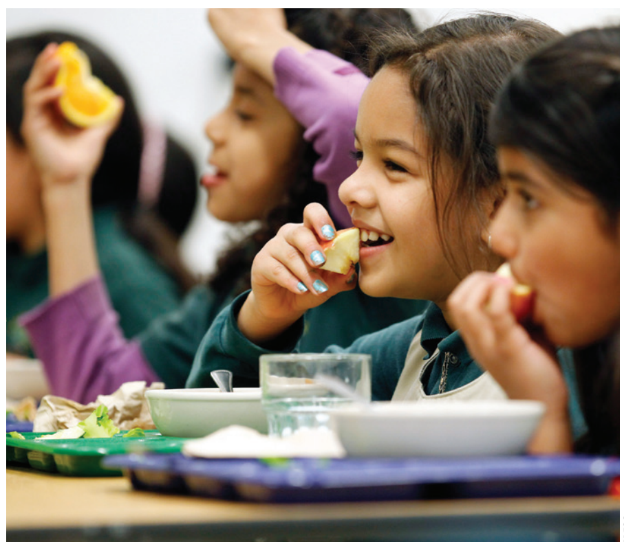
Schoolchildren are just some of the millions of people nationwide whose food choices are shaped by the Dietary Guidelines for Americans. In addition to promoting better health, these guidelines should prioritize the long-term health and sustainability of the food supply.

However, the impact of what we eat extends far beyond diseases related to diet. Heat-trapping emissions from food production contribute to climate change, which poses a multitude of risks to public health: higher temperatures, poorer air quality, and more frequent flooding and extreme weather events introduce greater