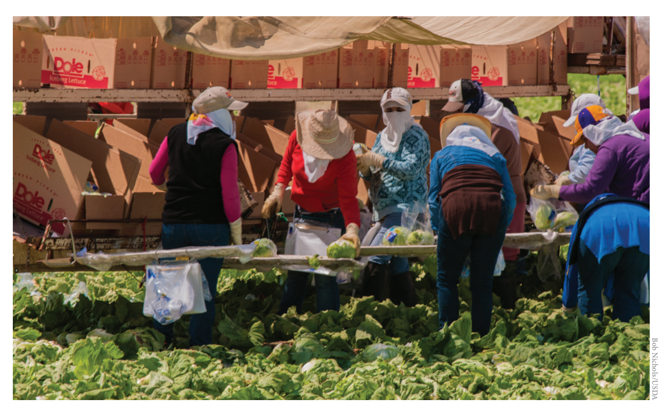
People who work in the US food system—such as these migrant workers at a lettuce farm in California—experience greater poverty, poorer healthcare access, and higher occupational health hazards (such as exposure to pesticides and extreme heat) than the general public. A truly sustainable diet must address not only environmental, but also social and economic outcomes associated with food production and healthy food access.

experience greater poverty, poorer healthcare access, and higher occupational health hazards relative to the general population (FCWA and SRC 2016; Moore et al. 2016; NCFH 2017). Agriculture is among the most dangerous industries in the United States, with frequent exposure to hazards such as pesticides, extreme heat, and dangerous machinery resulting in high rates of illness, injury, and death (NCFH 2018; Ferguson, Dahl, and DeLonge 2019). Finally, both low-income populations and many communities of color are more vulnerable to the environmental consequences of unsustainable food systems, such as climate change, water pollution, and other environmental impacts (APHA, n.d.; Harlan et al. 2019). There are many actions the US government can take to address the inequalities produced and perpetuated by the US food system. One important action is to support research and recommendations for dietary patterns and associated agricultural practices that can help improve social, economic, and environmental conditions for families, food producers, and frontline communities experiencing the impacts of climate change and food insecurity firsthand.