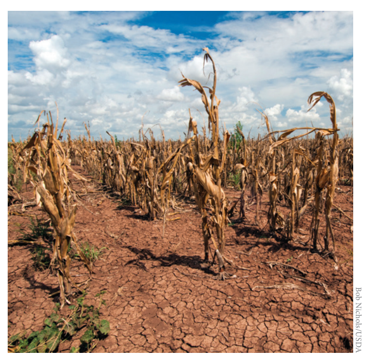
Unsustainable agricultural systems contribute to climate change and degrade natural resources such as air, soil, and water that both farmers and the public rely on. Policies that support shifts to more sustainable agricultural practices alongside dietary shifts are needed to ensure a healthy food supply in the future.

The Dietary Guidelines is the nation's leading set of science-based nutrition recommendations aimed at supporting public health and preventing chronic disease. The guidelines are a critical tool for health professionals, policymakers, and administrators of federal food and nutrition programs serving millions of kids, parents, seniors, veterans, and other members of the general public each day (HHS and USDA 2015). Since 1990, Congress has required revision of the guidelines every five years to ensure that they reflect the best available science