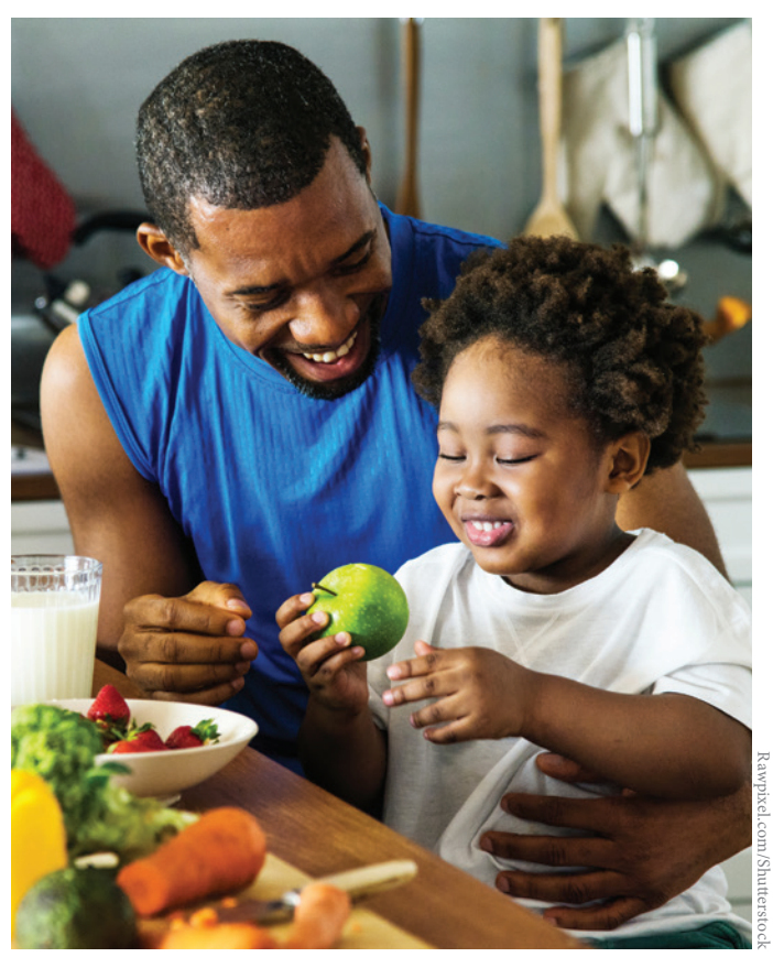
The Dietary Guidelines for Americans should recommend dietary shifts that not only improve public health through chronic disease prevention, but also mitigate climate change and help protect a healthy food supply for future generations.

resources and should appeal to members of Congress representing a range of interests. Congress should actively support the inclusion of sustainability principles and research in the 2020-2025 Dietary Guidelines for Americans—ensuring that public health, rather than food industry interests, remains the driving force in federal policymaking—and should provide federal agencies with the funding and resources needed to effectively implement dietary guidance across key federal nutrition programs.