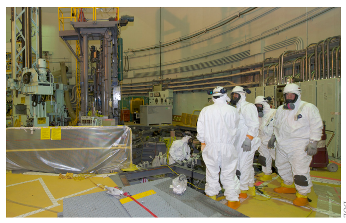
In 2019, political officials at the White House suppressed EPA scientist findings about the toxicity of even low levels of the chemical trichloroethylene, which can deform fetal hearts. Here, federal workers engage in a cleanup of industrial contamination in Idaho, including trichloroethylene removal.