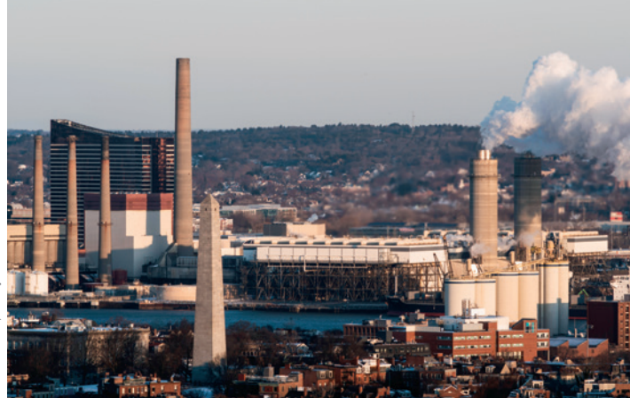
As Massachusetts decarbonizes its economy, the electricity sector plays a key role given the adverse climate and health consequences of fossil fuel-fired power plants (such as the gas-fired Mystic plant in Everett, one of the state's most polluting facilities). Our modeling research shows that Massachusetts can meet 100 percent of its electricity needs by 2035 using renewable resources.

Recognizing the urgent need for action, the 2021 Climate Roadmap law commits the Bay State to net-zero emissions across the economy by 2050. As the state decarbonizes its economy, the electricity sector plays a key role given the adverse climate and health consequences of burning gas<sup>1</sup> and other fossil fuels to generate electricity, and given the importance of electrifying heating and transportation. Proposed legislation would commit the state to transition to 100 percent clean electricity by 2035 and 100 percent clean heating and transportation by 2045,