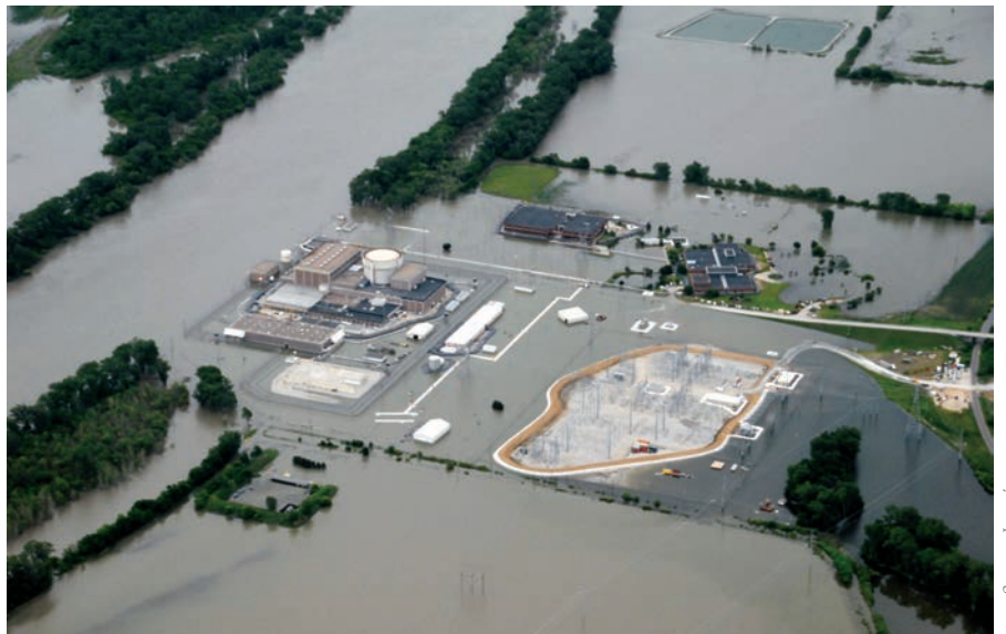
U.S. Army Corps of Engineers

Fort Calhoun received its first operating license in 1973, and the NRC relicensed the plant in 2003 to continue operating for as long as 20 more years. Neither of these licensing efforts, nor the tens of thousands of hours the NRC spent inspecting Fort Calhoun, led the agency to discover any of these many safety problems.