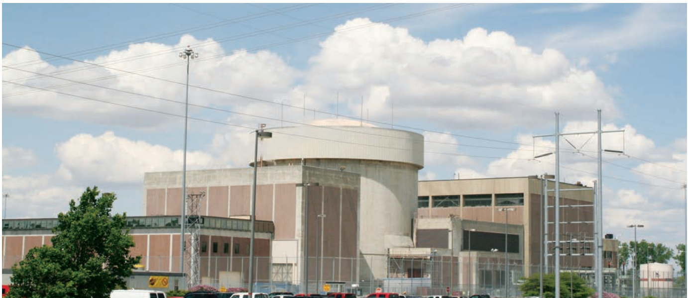
In March 2013, Fort Calhoun's owner reported that it had completed 20,000 tasks required by the NRC before the reactor could be restarted—but still had approximately 5,000 more to do. Some of the tasks entailed correcting serious safety problems.