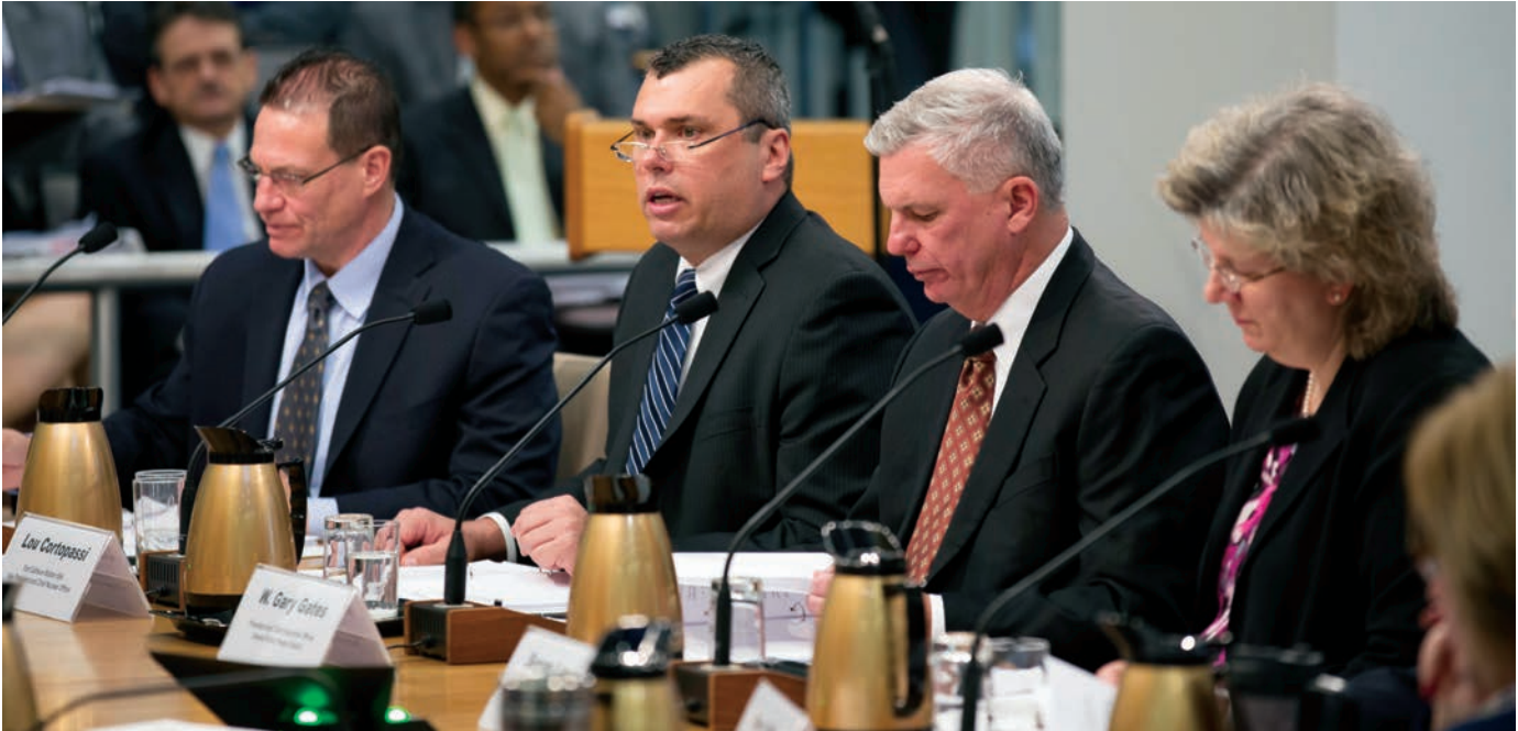
Senior executives from the Fort Calhoun plant briefed NRC staff and commissioners several times (including here in June 2013) before they were allowed to restart the reactor.