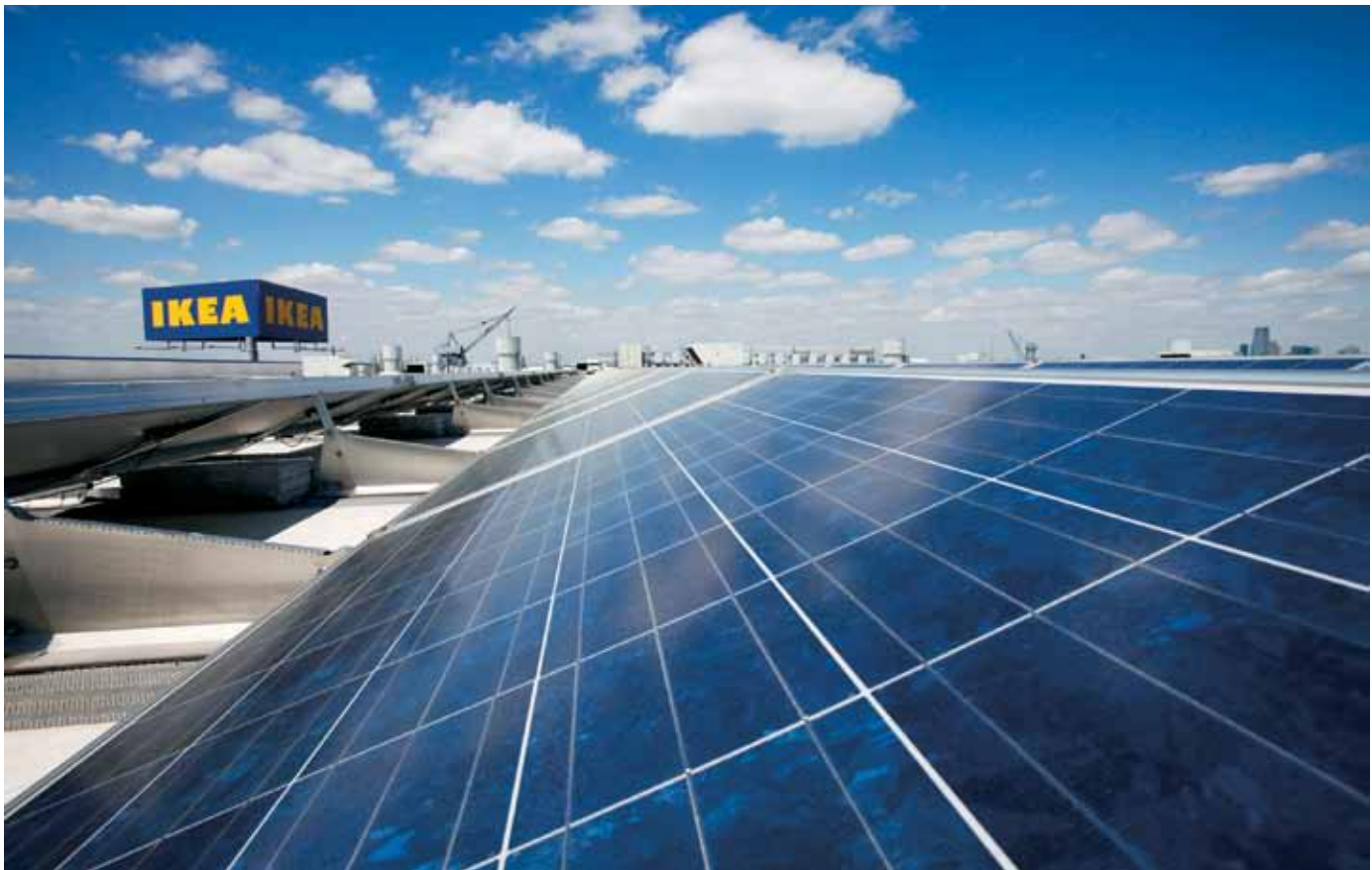
Businesses play a large role in driving renewable energy, motivated not just by the potential to save energy and money directly but also by the ability to demonstrate leadership in a key sector undergoing transformation. Swedish furniture giant IKEA has solar on 90 percent of its US stores.

With uncertainty surrounding national energy policy, state leadership is more important than ever. This analysis prompts UCS to offer several recommendations for states to accelerate clean energy momentum and lead the nation to a new energy future: