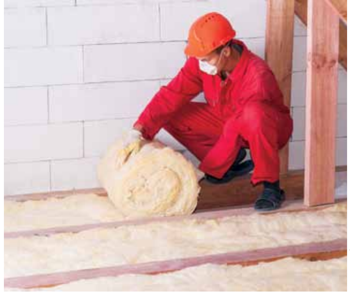
Energy efficiency is a powerful clean energy resource, and has played a key role in building momentum across states. Energy efficiency resource standards drive efficiency for homes and businesses.