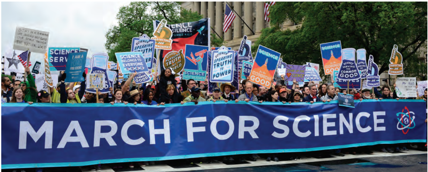
On April 22nd, the March for Science attracted over a million people worldwide to gather and call for evidence-based policy decisions. Roughly 100,000 scientists and science supporters protested in Washington, D.C.