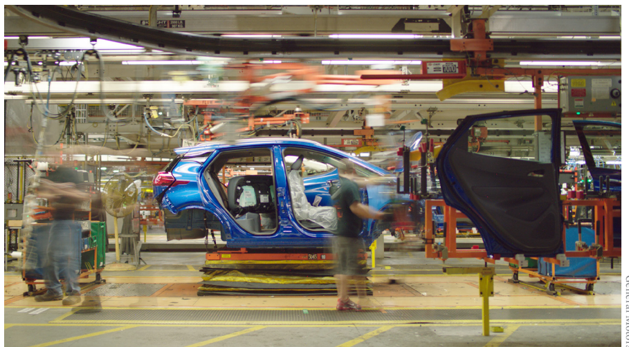
Electric vehicle sales have increased significantly in recent years. With many of these cars being assembled in the United States, federal and state incentives that help spur EV sales also help make the vehicles more affordable—keeping the United States a leader in EV technology.

It is essential to maintain policies supporting the adoption of EVs so that the technology reaches mass-market commercialization as quickly as possible. Incentives for EVs will translate into fewer global warming emissions in the near term, and enable even greater emissions reductions in the future. Earlier adoption of EVs also will enable drivers to realize fuel cost savings more quickly, thereby increasing demand for EVs, many of which are being built in the United States.