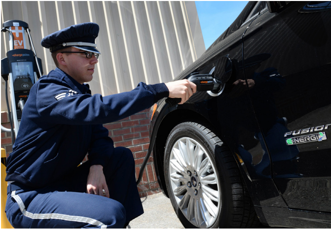
Electric vehicles are cheaper to operate and produce less global warming emissions compared with today's gasoline-powered vehicles. Incentives for EVs today mean fewer emissions in the near term, and enable even greater emissions reductions in the future.

in 2010 reached $1,000 per kilowatt-hour (kWh) (Nykqvist and Nilsson 2015). In contrast, Tesla reported that the battery pack for the new Model 3 battery-powered EV would cost $190 per kWh, and an analysis of General Motors' 2017 Chevrolet Bolt EV calculated a cost of about $205 per kWh (Voelcker 2017; Voelcker 2016).