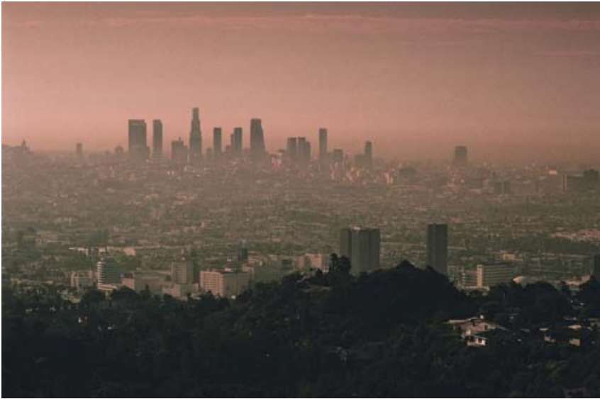
Many regions of California rank among the worst in the country for air quality. Reduced air pollution is an important “co-benefit” of efforts to reduce global warming emissions. LA smog photo courtesy of the Environmental Protection Agency.

Methane and several other toxic gas emissions, like benzene, are lower, in part because the global warming emission reduction efforts are shifted to the methane-intensive agriculture and landfill sectors. 1