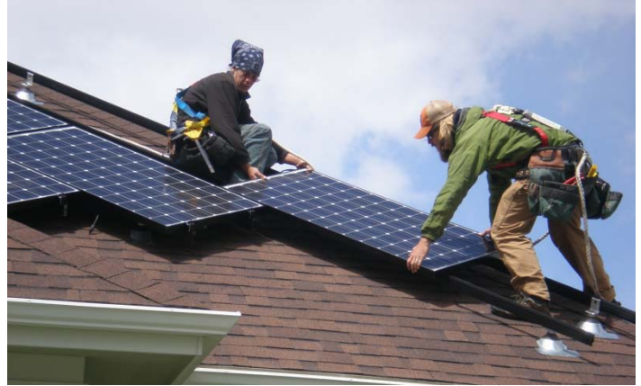
Alabama has excellent potential for developing in-state solar power and other renewable energy resources, which can help reduce the state's dependence on imported coal while creating jobs and other economic and environmental benefits.

Alabama could further spur local renewable energy development, cut coal imports, and reduce its growing reliance on natural gas by adopting a renewable electricity standard, requiring utilities to gradually expand their use of renewable resources. Twenty-nine states and the District of Columbia have adopted this effective and affordable clean energy policy.