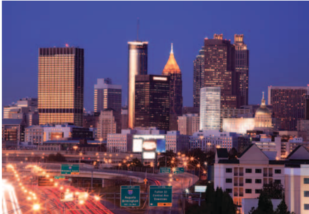
Atlanta, Georgia. The cost of importing coal is a drain on Georgia's economy, which relies heavily on coal-fired power. Investments in energy efficiency and homegrown renewable energy can help stimulate the economy by redirecting funds into local economic development—funds that would otherwise leave the state.

Georgia imported all the coal it used in 2008—some from as far away as Wyoming and South America. To pay for those imports, Georgia sent $2.62 billion out of state—more than any other state. Georgia Power, a subsidiary of Southern Company and the largest provider of electricity services in the state, purchased nearly all that imported coal ($2.56 billion). Georgia Power's Bowen plant, in Euharlee, spent $706 million on coal imports—more than any other facility in the United States. The plant is the third-largest source of carbon dioxide emissions (the main cause of global warming) among hundreds of coal plants nationwide.