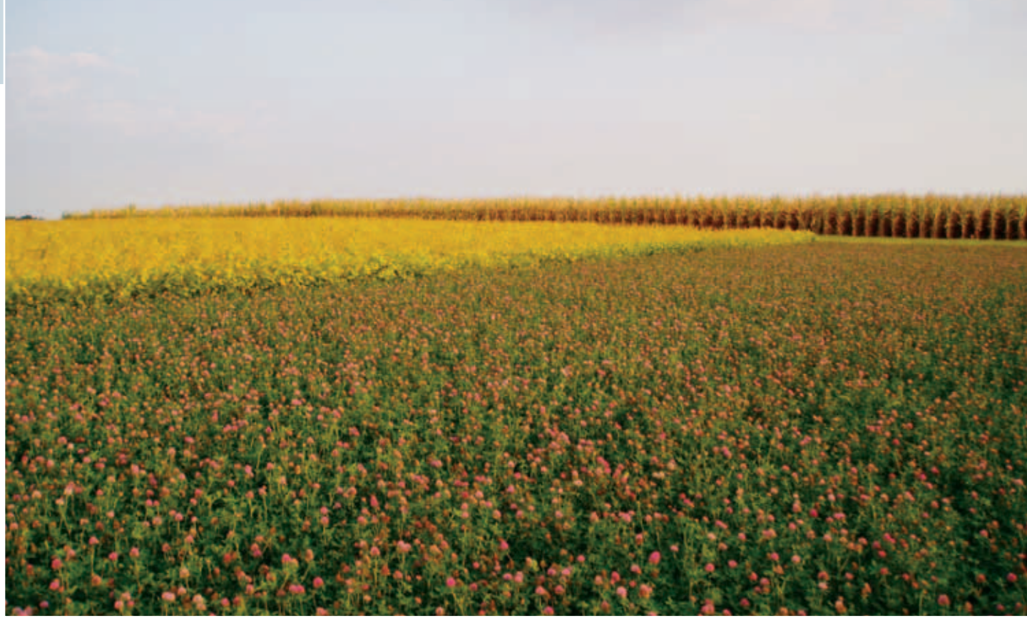
The nine-year Marsden Farm study—conducted by researchers from the USDA, the University of Minnesota, and Iowa State University—replicated the industrial corn-soy midwestern farming system alongside two multi-crop alternatives. A three-year rotation incorporated another grain plus a red clover cover crop (pictured here), and a four-year rotation added alfalfa, a key livestock feed, into the mix. The more complex systems enhanced yields and profits, controlled weeds, and reduced chemical fertilizer, herbicide, and energy use.