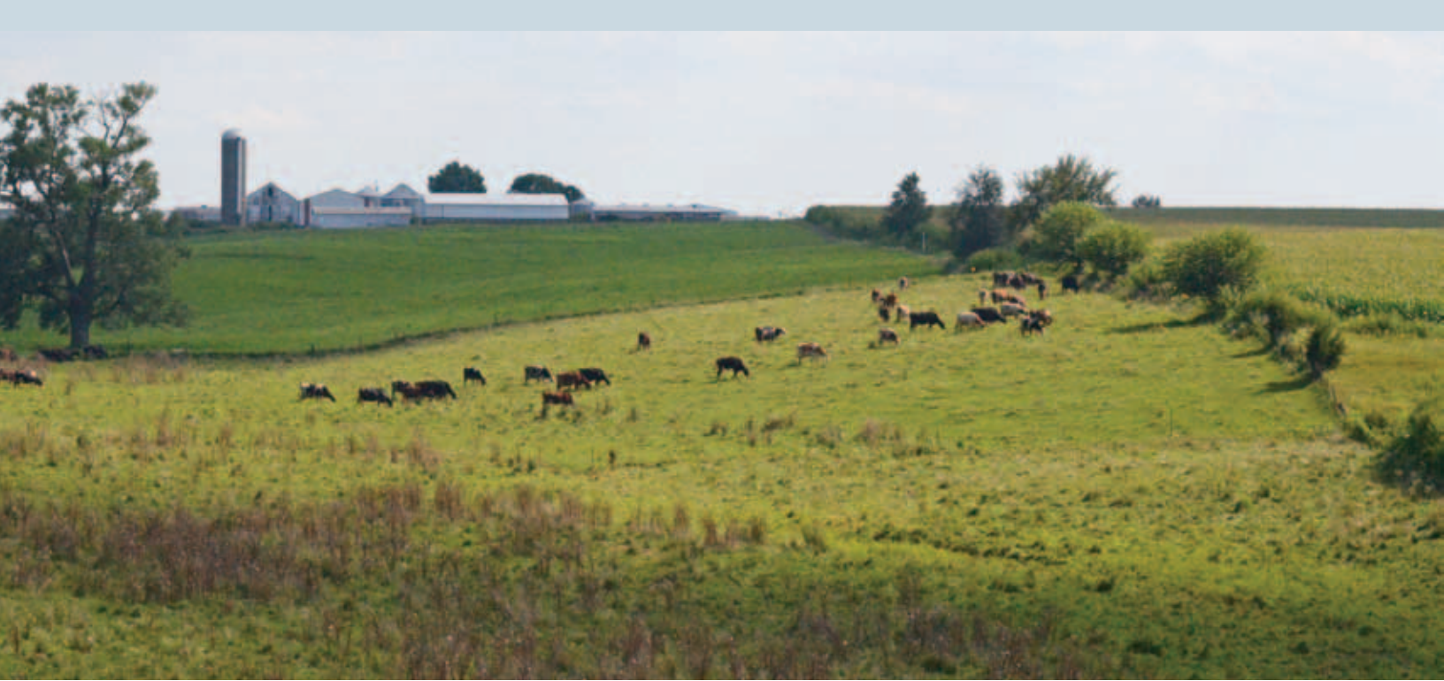
On this farm near Peosta, IA, dairy cattle graze on a field that is between crop rotations. A corn crop is visible on the far right.