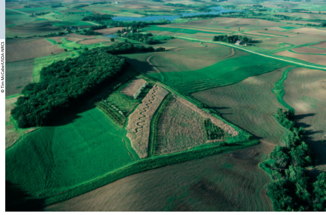
This aerial photo over Shelby County, IA, depicts prairie grasses and woodland plantings on and around farmland. Research shows that leaving such uncultivated areas is beneficial to farms and the environment.

Interconnected. Rather than considering farms as isolated entities, scientists now recognize that uncultivated areas on or near farms can provide important benefits for both the surrounding landscape and the farm itself. For example, hedgerows, fields, woodlots, and stream borders provide habitat for insects that pollinate crops and control farm pests, which in turn can boost productivity and reduce the need for pesticides (Meehan et al. 2011, Tscharntke et al. 2005).