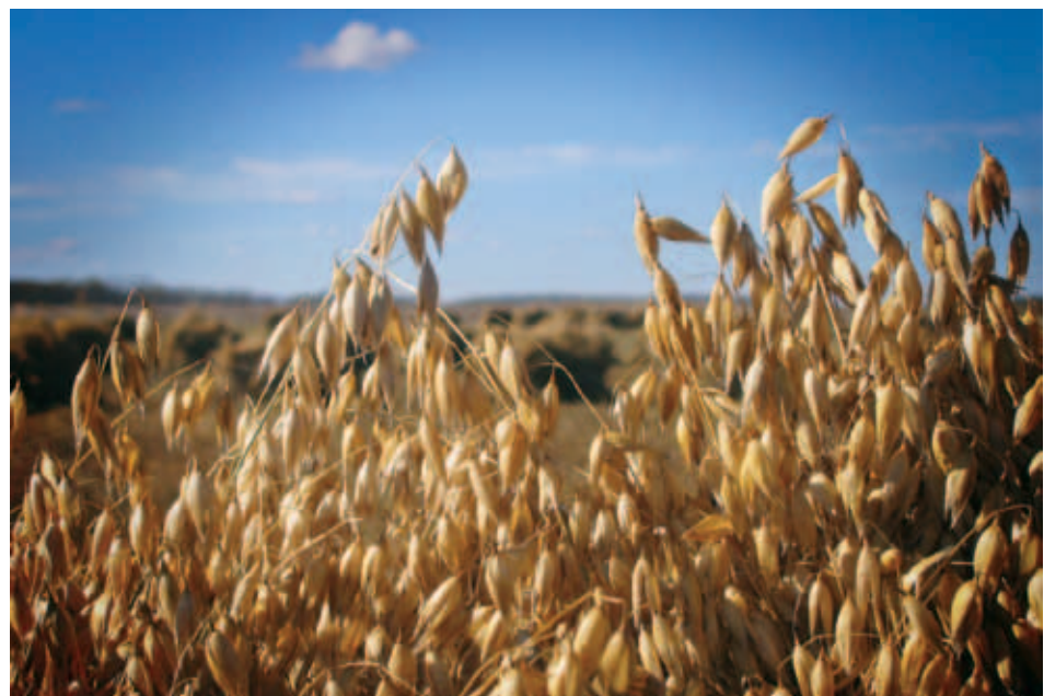
Multi-year, multi-crop rotations—including more small grains such as the oats pictured here—help to control pests and weeds with less reliance on chemical pesticides.

New additions to the rural landscape could also include bioenergy crops such as perennial grasses. These so-called cellulosic feedstocks can be grown on marginal land, enhance soil fertility by promoting the growth of various soil organisms, and provide a climate-